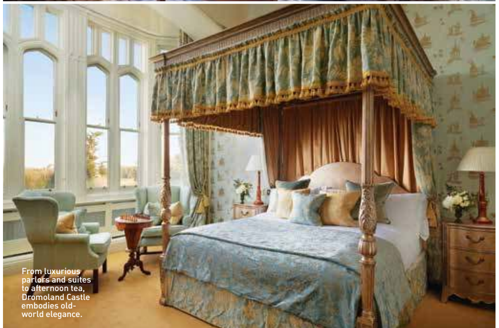
From luxurious parlors and suites to afternoon tea, Dromoland Castle embodies old-world elegance.