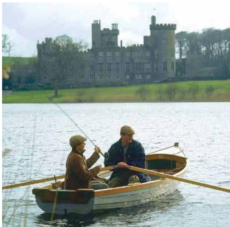
Dromoland Castle is set on 450 majestic acres, offering guests numerous outdoor amenities and opportunities to interact with wildlife.

For our family, it was the experience of living like royalty, surrounded by luxury, beauty, and exceptional service. We left feeling completely disconnected from our hectic lives and brought home memories for a lifetime. ♦