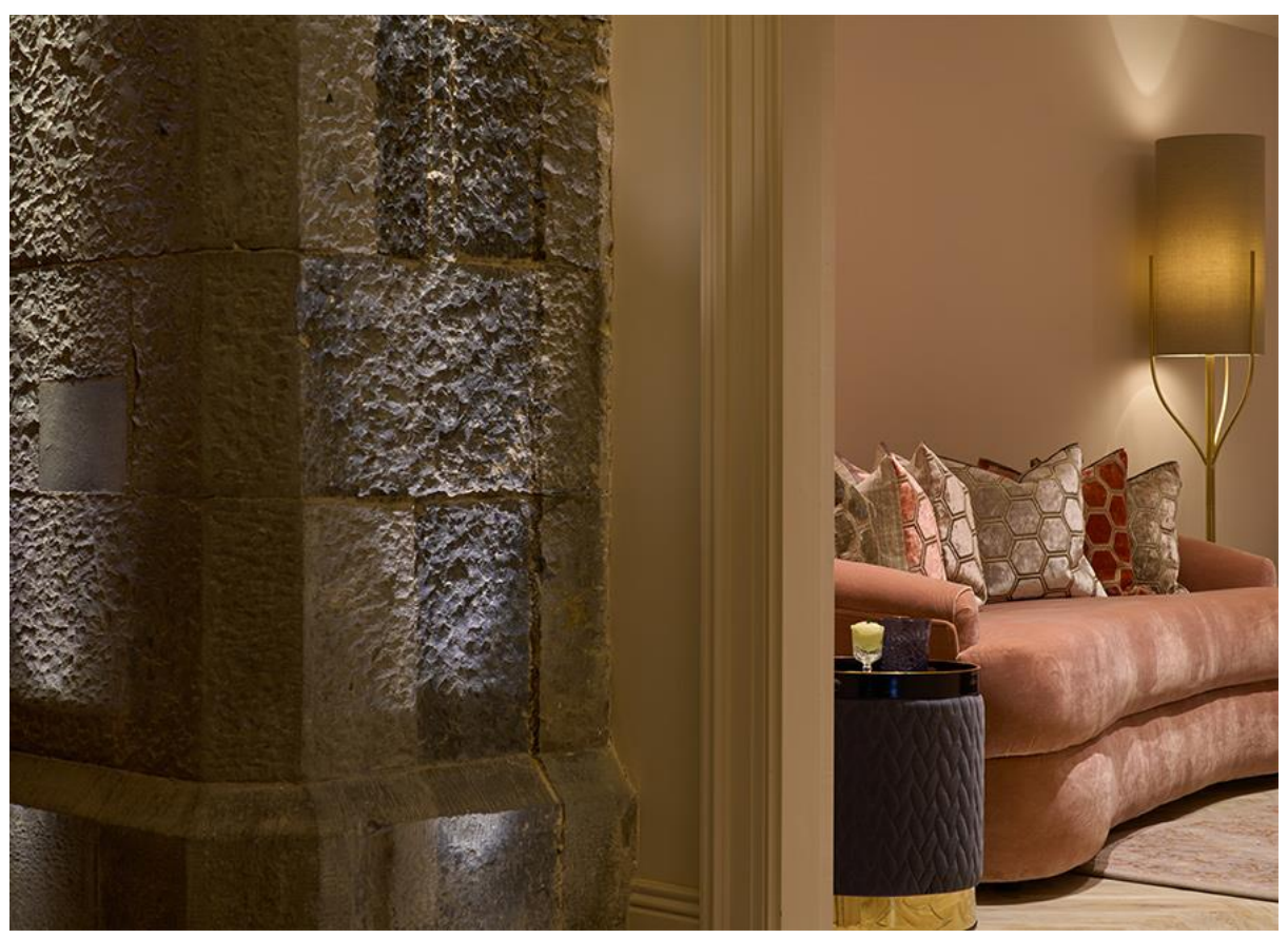
PIC: THE CASTLE SPA AT DROMOLAND