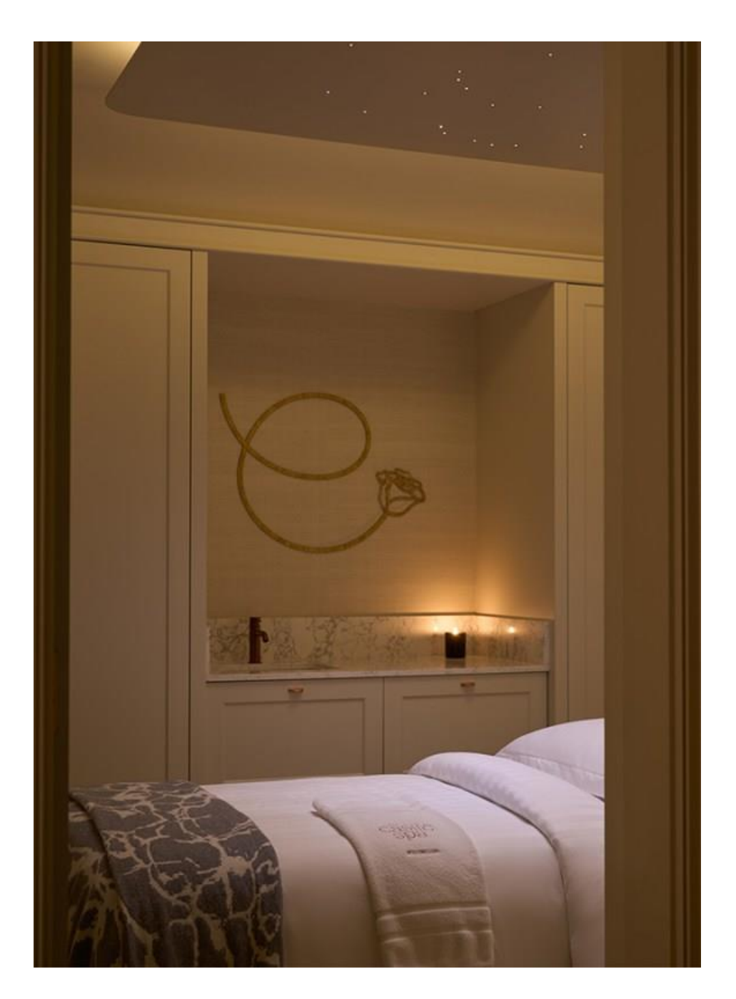
PIC: THE CASTLE SPA AT DROMOLAND

The Whisper Room is where you go to relax afterward. Each of the six beds is adjustable and massage you as you snooze, there are curtains to pull around you should you wish for privacy.