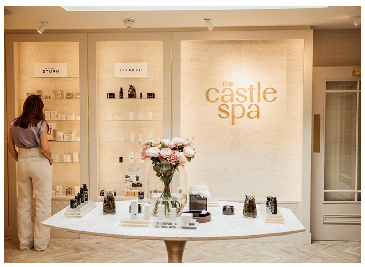
THE CASTLE SPA AT DROMOLAND CASTLE HOTEL.