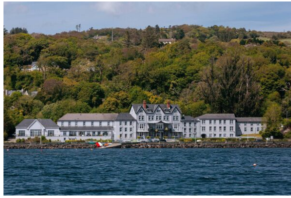
The Eccles Hotel, Glengarriff

Google Maps identified the quickest route. Deep down we knew better than to follow the obscure directions but the automated voice spoke with such authority. Before we knew it we were driving down county lanes, grass creeping through the paths.