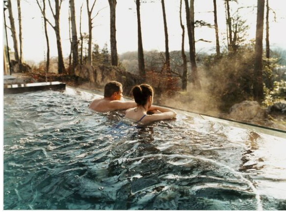
Park Hotel, Kenmare